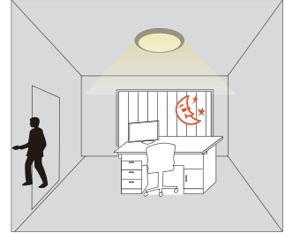
If there is no more movement, the light dims to stand-by dimming level after hold-time.