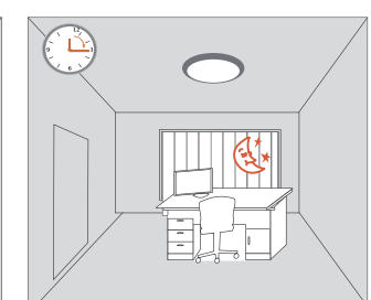
The light turns off automatically after stand-by time.